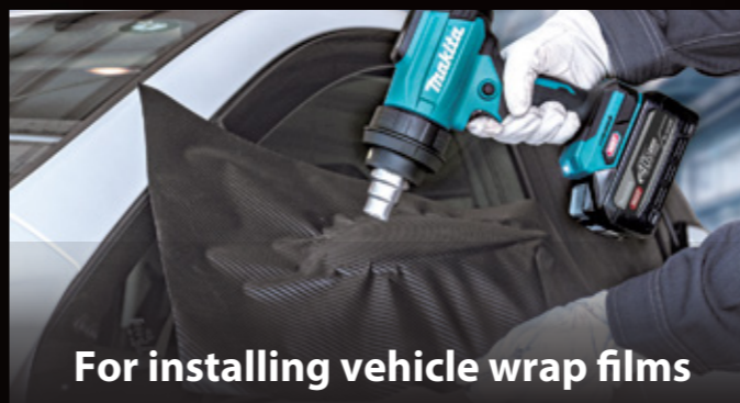
For installing vehicle wrap films