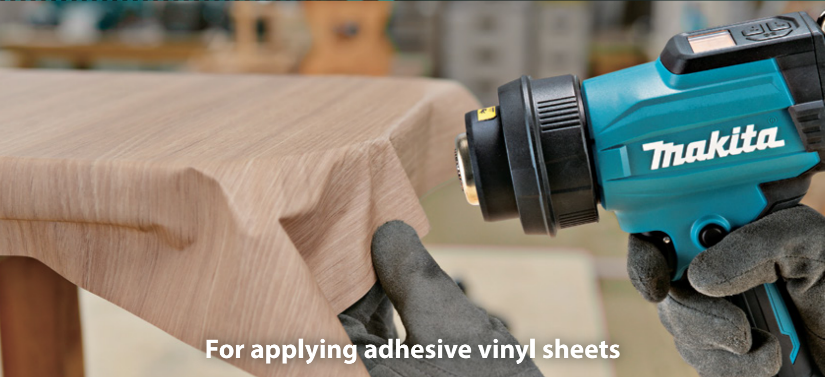
For applying adhesive vinyl sheets