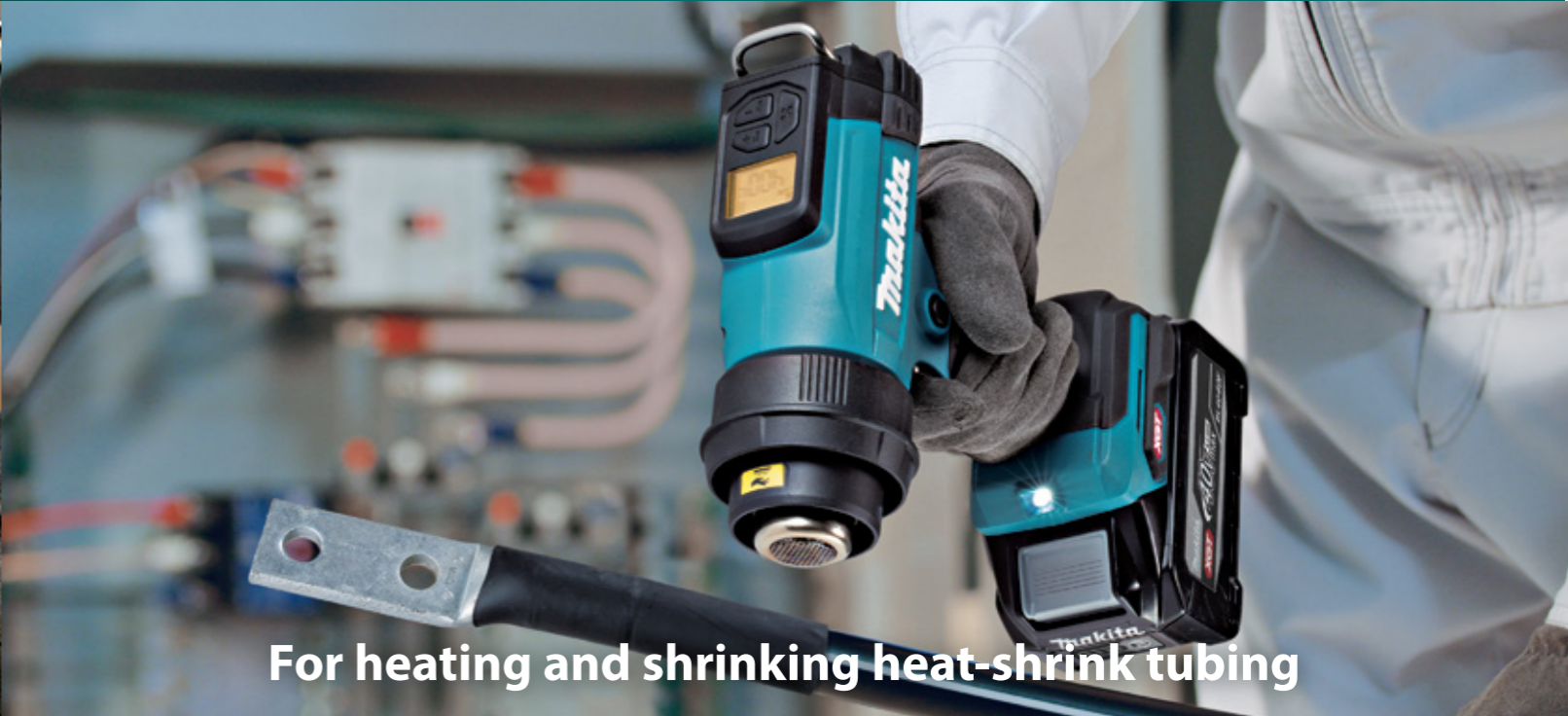
For heating and shrinking heat-shrink tubing