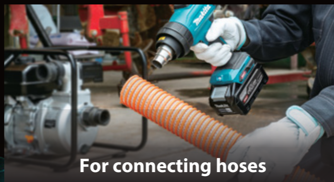
For connecting hoses