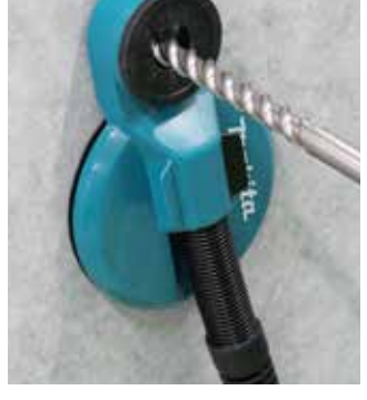
Drill chuck set Part No. 194041-7