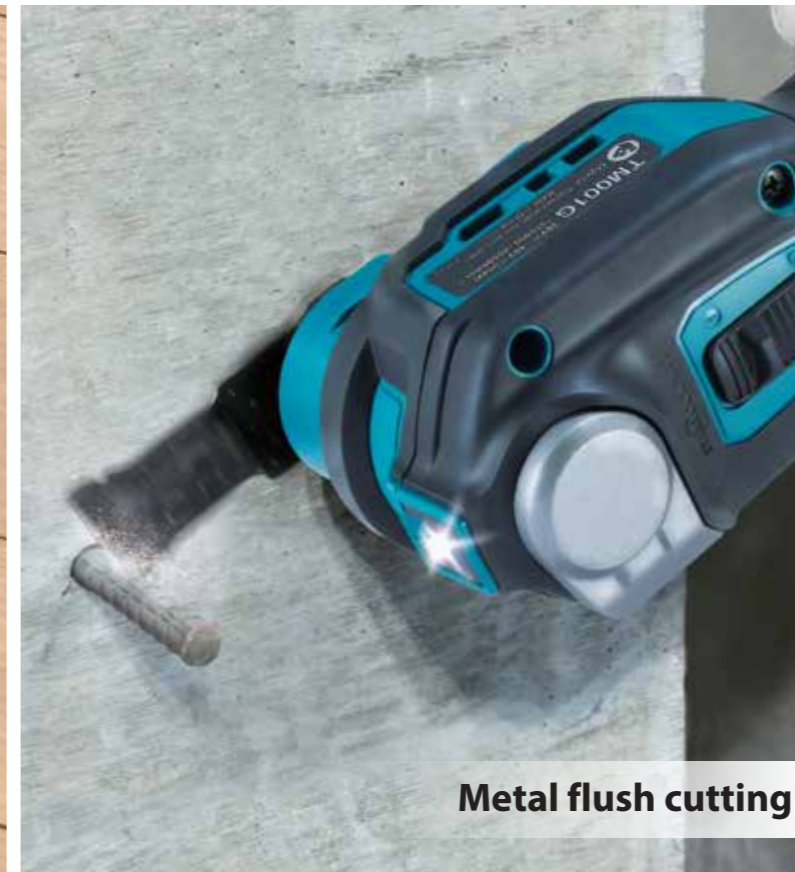
Metal flush cutting