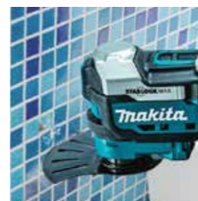
Routing joints on wall tiles