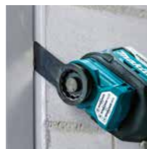
Cutting window putty, silicone