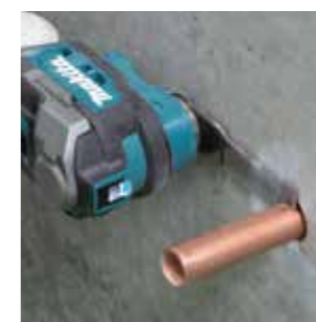
Copper pipe flush cutting

Work amount Downward plunge cutting (at a pressing load of 25N) into a 38mm thick SPF