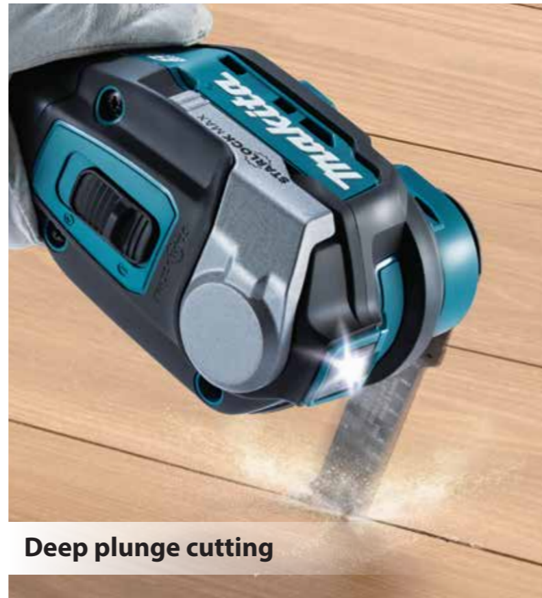
Deep plunge cutting

Small diameter grip for easy gripping Slimmer grip design has been achieved by positioning the motor vertically on the front side.