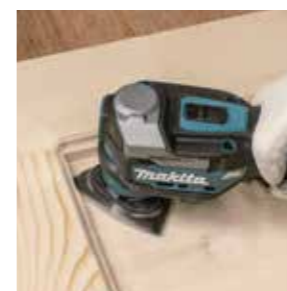
Sanding and polishing