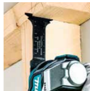
Wood flush cutting