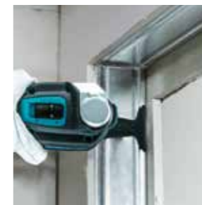
Door opening work