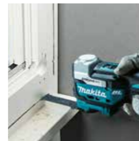
Removal of window frame