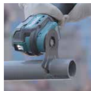
Cutting PVC, FRP pipes