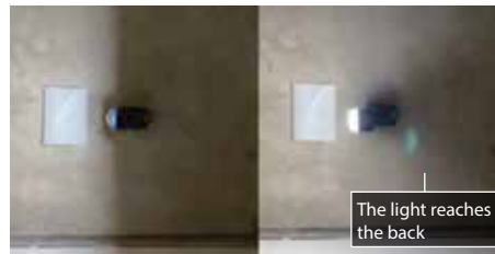
without Lamp shade with Lamp shade