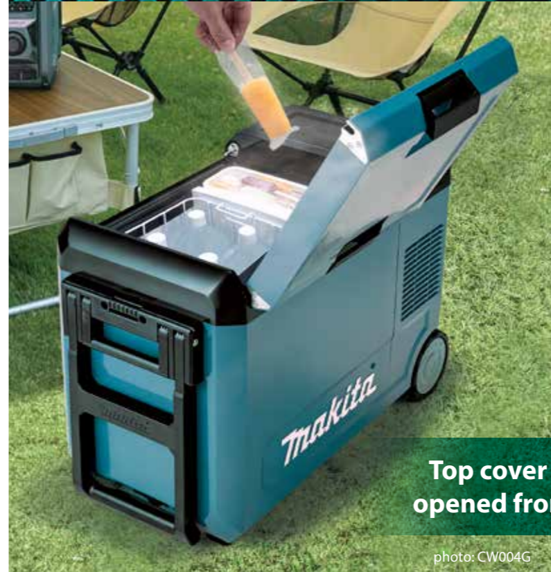
Top cover that can be opened from both sides