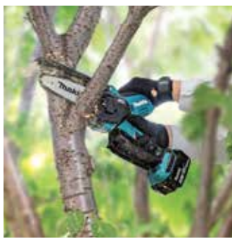
DUC150 18V BL MOTOR XPT