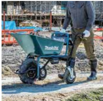
DCU603 18V x2 BL MOTOR XPT WG