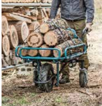
DCU180 18V BL MOTOR XPT