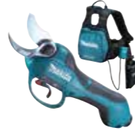
DDG460 18V x2 BL MOTOR XPT ADT LXT