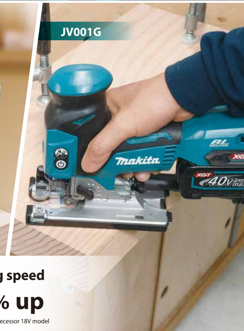
Barrel handle JV001G