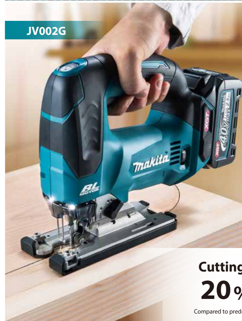
Top Handle JV002G