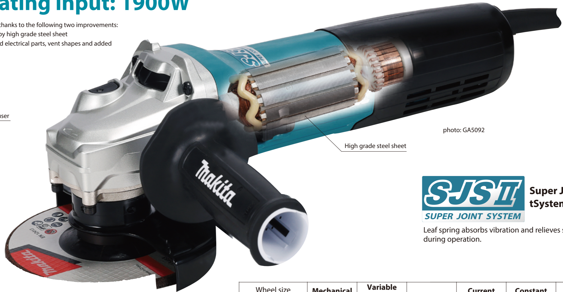
High grade steel sheet