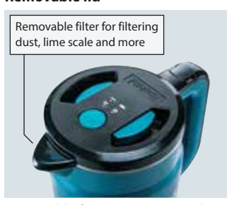
Removable for easy water supply and cleaning