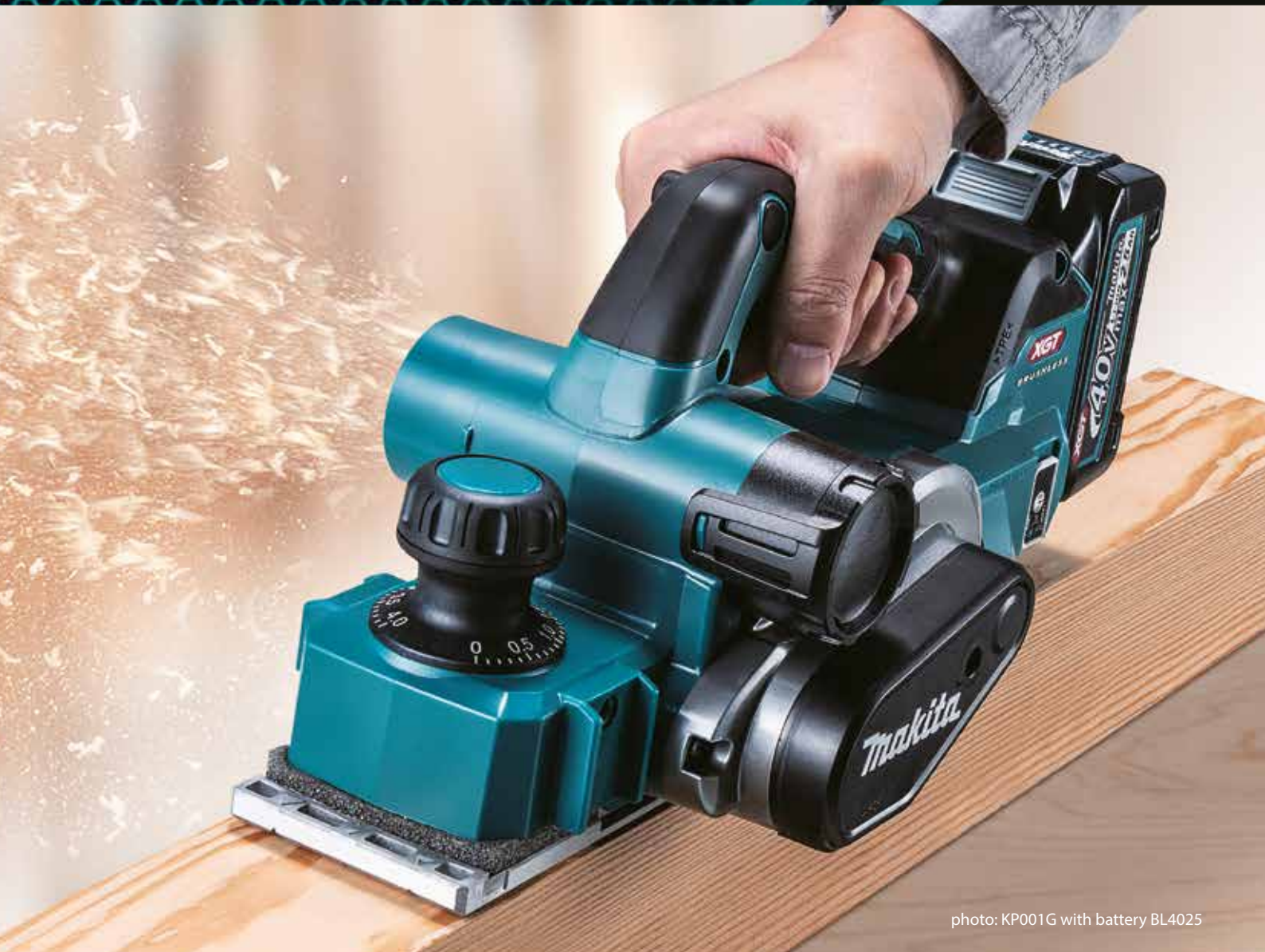
photo: KP001G with battery BL4025