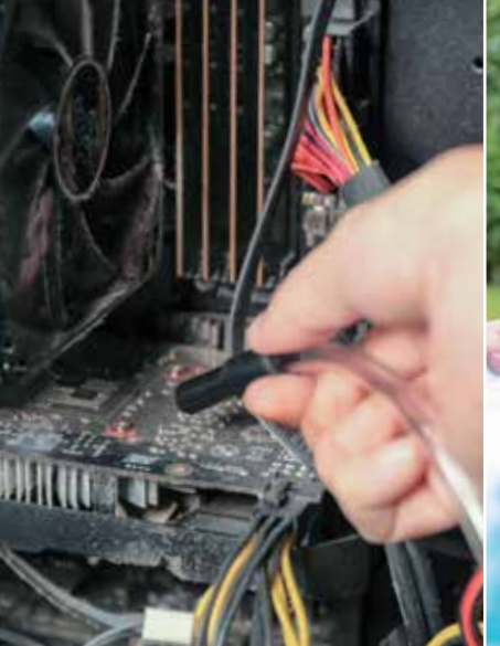
Flexible nozzle complete set Part No. 191X21-8 For blowing dust away from OA