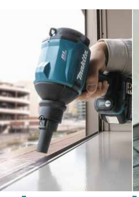
Nozzle 13 set Part No. 191X15-3 • For blow-off works • For inflating large play pools, etc.