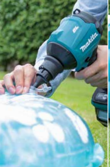
Pinch valve nozzle set Part No. 191X17-9 For inflating/deflating inner tubes and