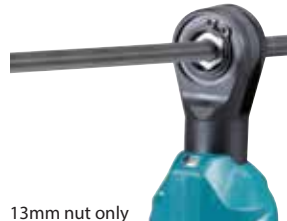
13mm nut only