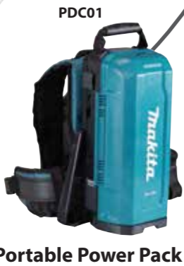
Portable Power Pack

If the cord of the tool adapter is loaded with a certain weight or over, the intermediate connector between the tool and the tool adapter is automatically disconnected.