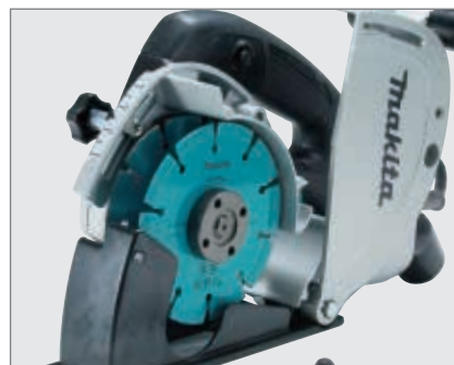
Aluminum blade case designed to allow for easy blade replacement