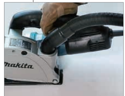
Connectable to vacuum cleaners for clean work environment