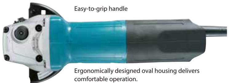
Ergonomically designed oval housing delivers comfortable operation.