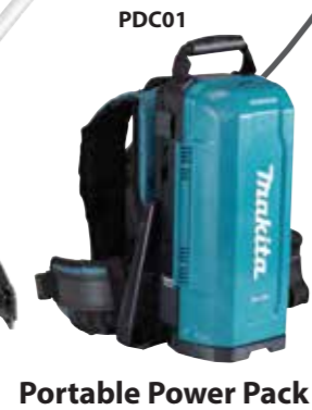
Portable Power Pack

If the cord of the tool adapter is loaded with a certain weight or over, the intermediate connector between the tool and the tool adapter is automatically disconnected.