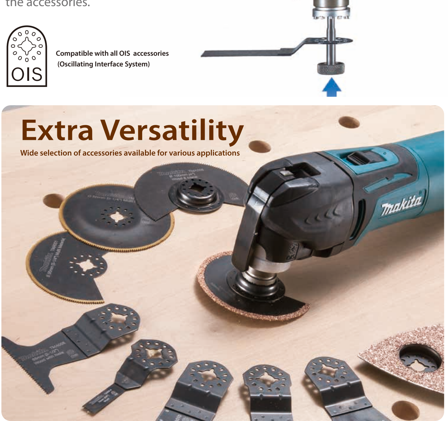
The standard equipment may vary by country.