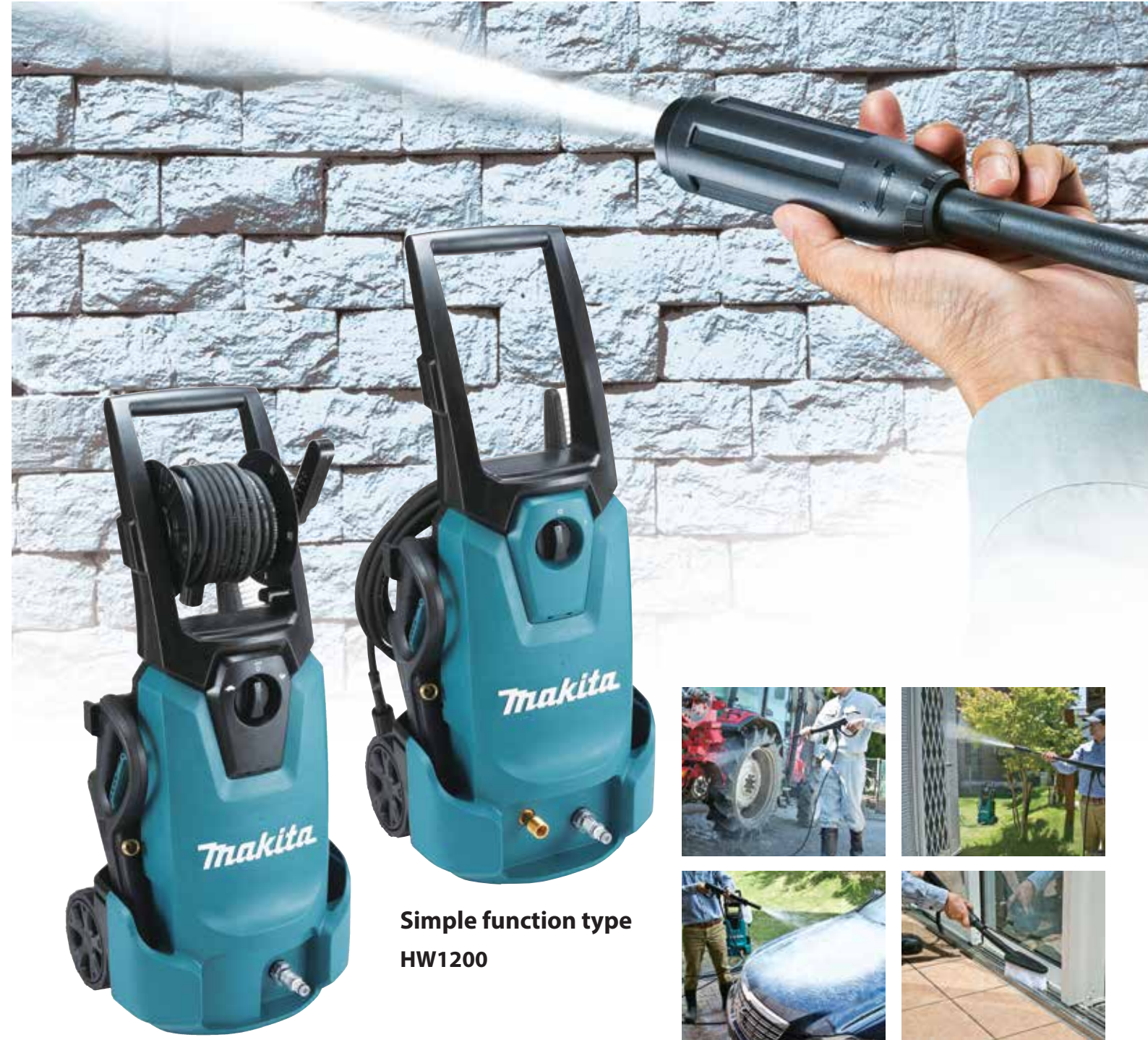
Simple function type HW1200