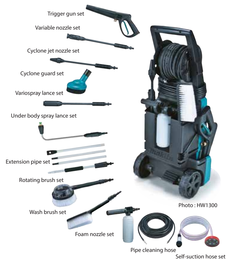
Photo : HW1300