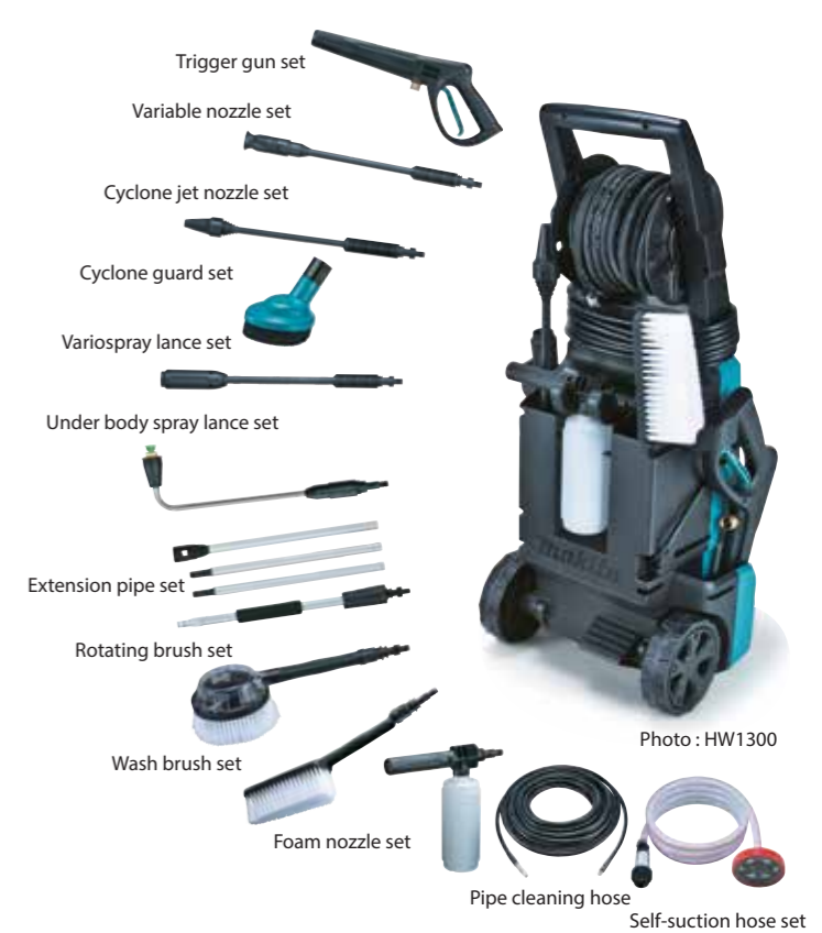
Photo : HW1300