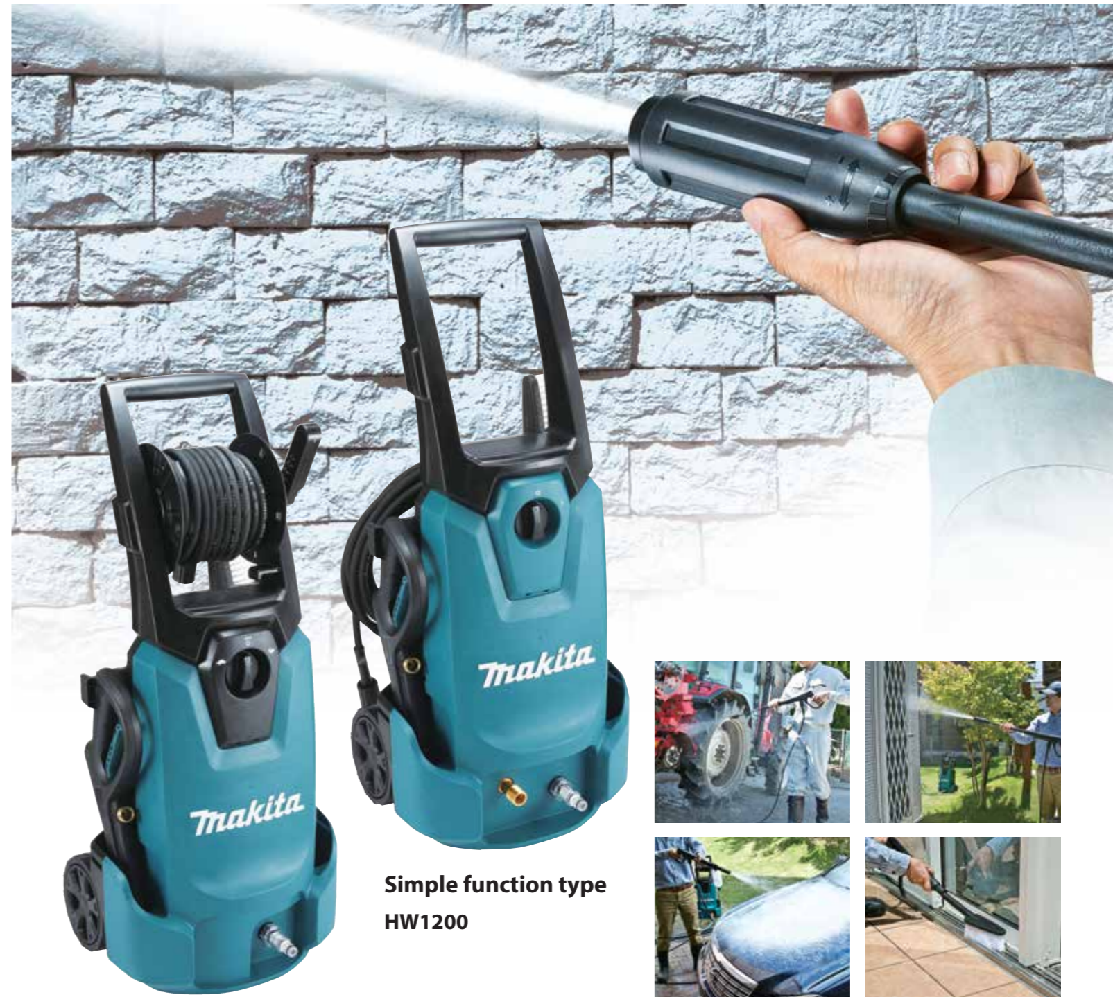
Simple function type HW1200