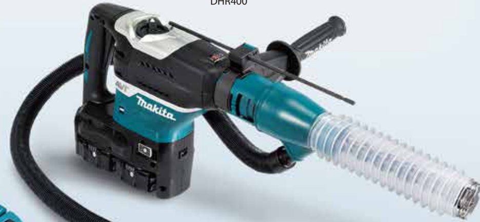
Cordless Rotary Hammer DHR400