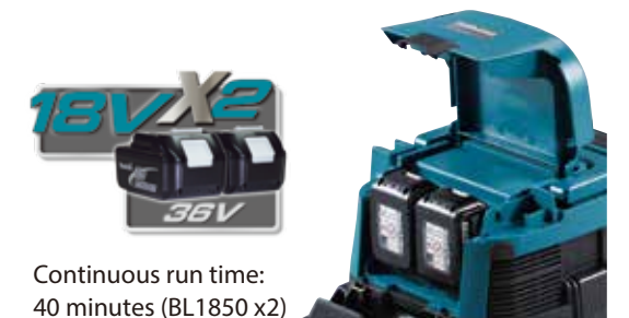
Continuous run time: 40 minutes (BL1850 x2)