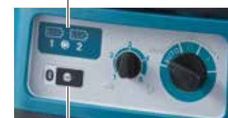
Wireless activation button