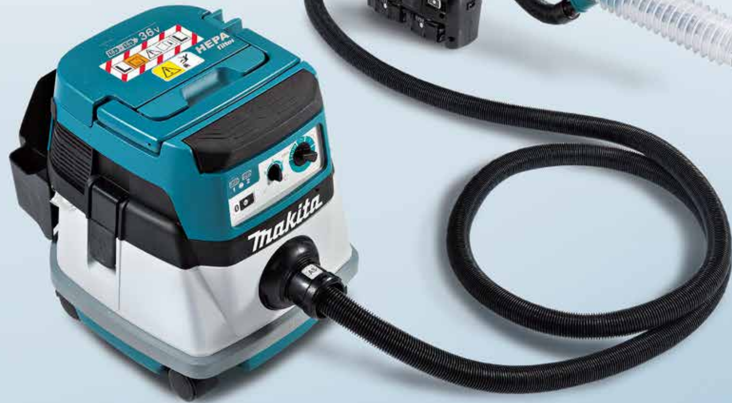
Cordless Vacuum Cleaner DVC864L