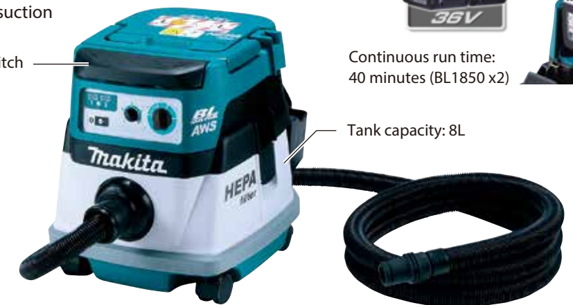
Tank capacity: 8L