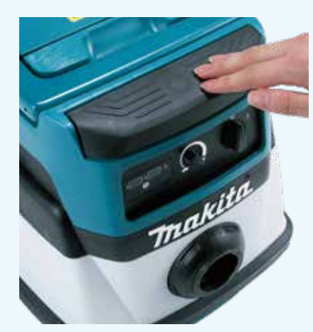
Large on-off switch