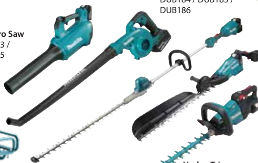
Hedge Trimmer DUH501 / DUH601 / DUH751 / DUH502 / DUH602 / DU752 / DUH604S / DUH754S / DUH523 / DUH483