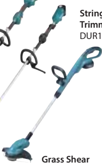
Grass Trimmer DUR184L / DUR189 / DUR190U / DUR190L / DUR191U / DUR191L / DUR192L