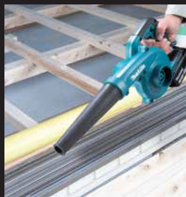
For blowing dust in the sash