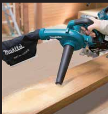
For vacuum use