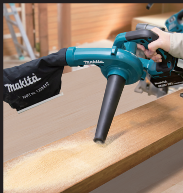
For vacuum use