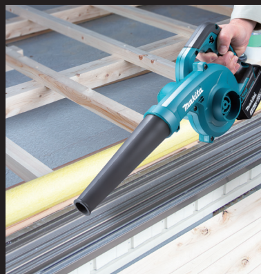
For blowing dust in the sash