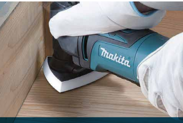
Sanding and polishing various materials