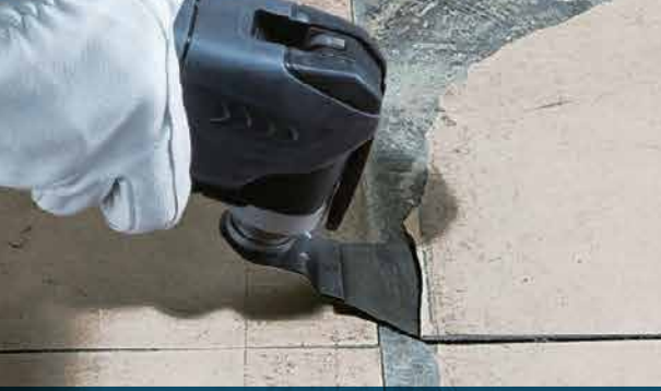
Scraping floor tiles