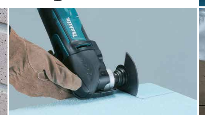
Cutting polystyrene, rubber