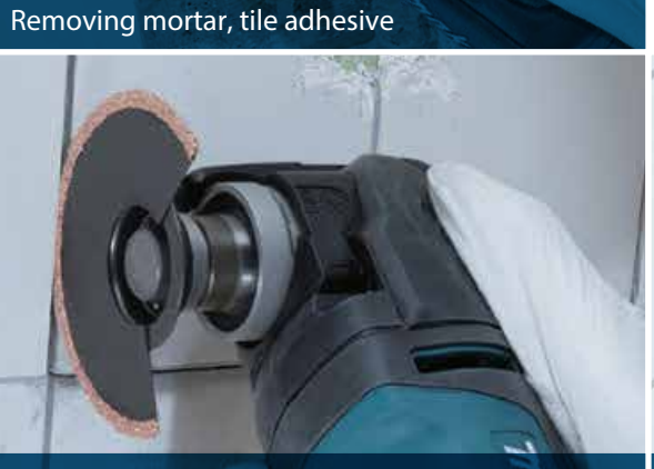
Routing joints on wall tiles