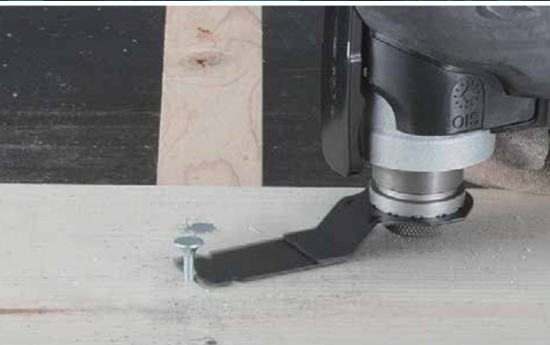
Flush cutting of nails