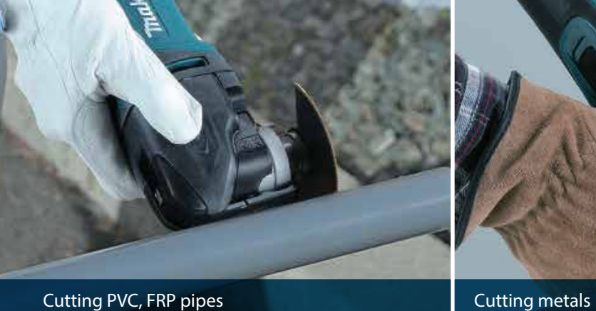
Cutting PVC, FRP pipes