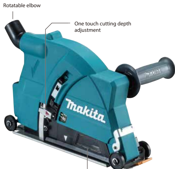
Clear cover to check blade tip

For DGA900 & AC 230mm Angle Grinder Max cutting depth: 60mm with three notches on Bearing box type Part No. 198440-5 (IEC) Use with Inner flange 45cc Part No. 198678-2 (for Diamond cut off wheel)