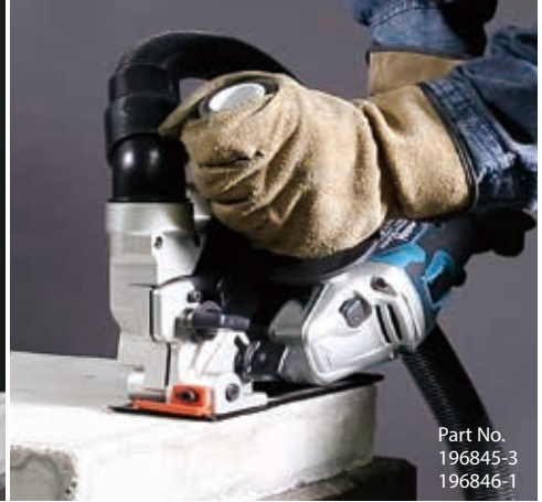
Part No. vary by country or area