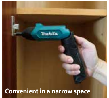
Convenient in a narrow space