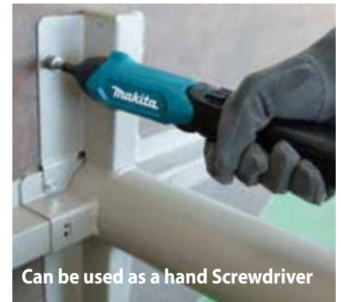
Can be used as a hand Screwdriver

Comes with 81 pcs assortment and Charger