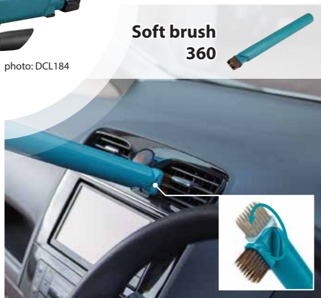
Soft brush 360