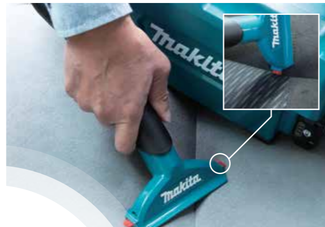
Seat nozzle 120