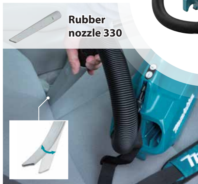
Rubber nozzle 330