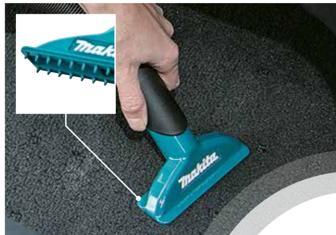
Mat nozzle 120