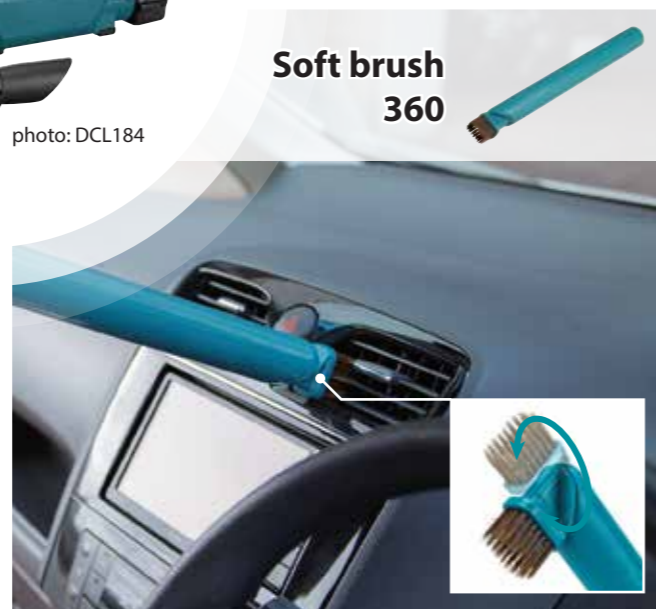
Soft brush 360