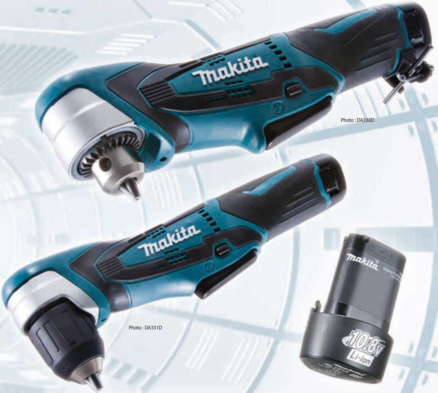
Photo : DA330D