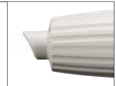
Diagonal suction inlet for easy quick cleaning without any attachments.