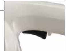
Trigger switch for easy on/off operation