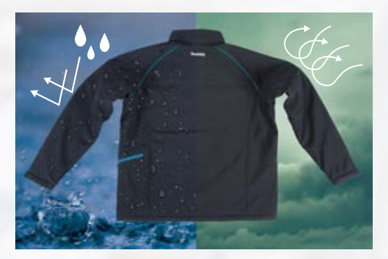
Fleece lining warms a body even when switch is off

prevents penetration of water such as light rain.