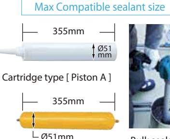
Bulk sealant type Sausage type [Piston B] [ Piston C ]