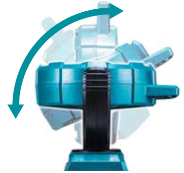
Up 90°, Down 45°, Left / Right 90°