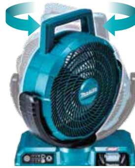
Left / Right 45°