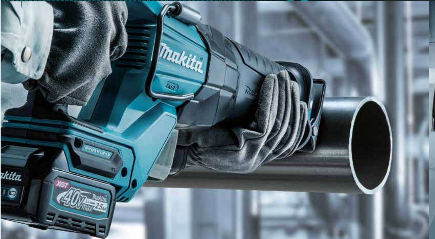
Recipro Saw JR001G