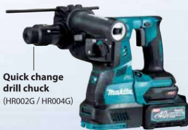
Quick change drill chuck (HR002G / HR004G)