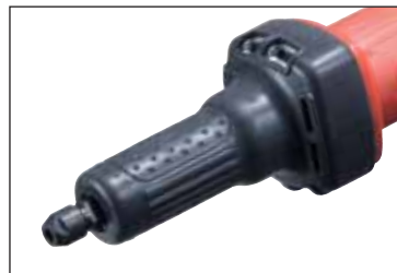
Anti-slip rubber cover is available.